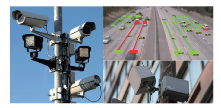
Fig. 2. Roadside units capturing real-time traffic situations and communicating with vehicles.

In order to ensure stable VANETs with seamless connectivity, full coverage over the best available channels is required. At the moment, managing the overlapping signals of adjacent roadside units is one of the biggest challenges. In a comprehensive simulation study, Ghosh and his research team [11] investigated "the feasibility and benefits of providing a ubiquitous communication in VANET under different mobile environments. The overlapping effect can be in-