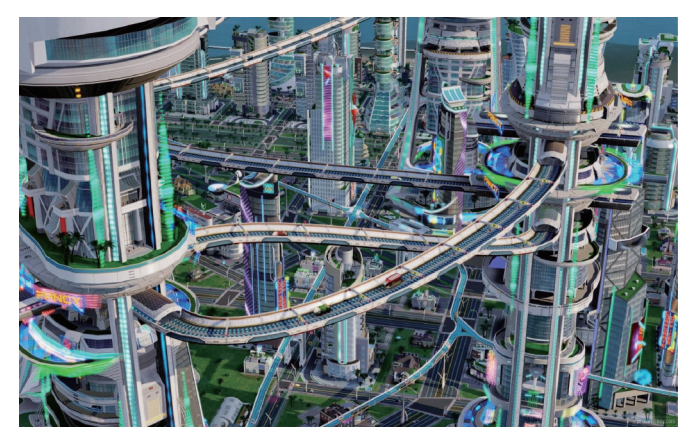
Fig. 4. The iCity of the future, with novel 3D mapping challenges [19].